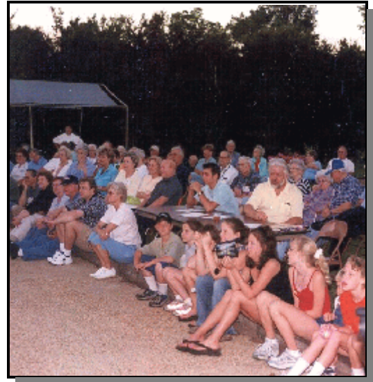
Family Night Crowd