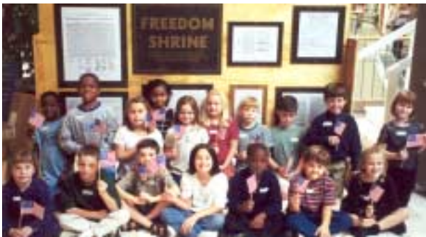
Pictured above are students from Ridgeland Elementary School, which is the first stop of the mobile Freedom Shrine display.