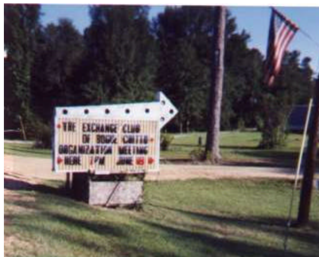
Bogue Chitto chose an innovative method to advertise for and recruit new members